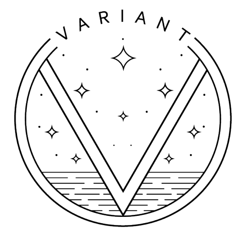
MUSIC GALA 2019