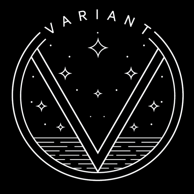
University of North Texas College of Music Gala 2019