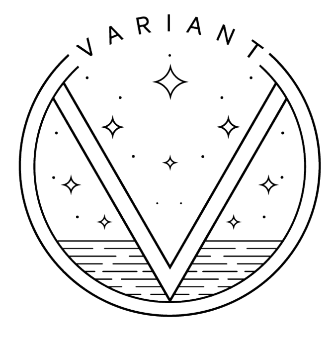
MUSIC GALA 2019